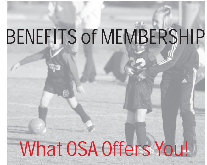
Illustration Based on 40,000 players